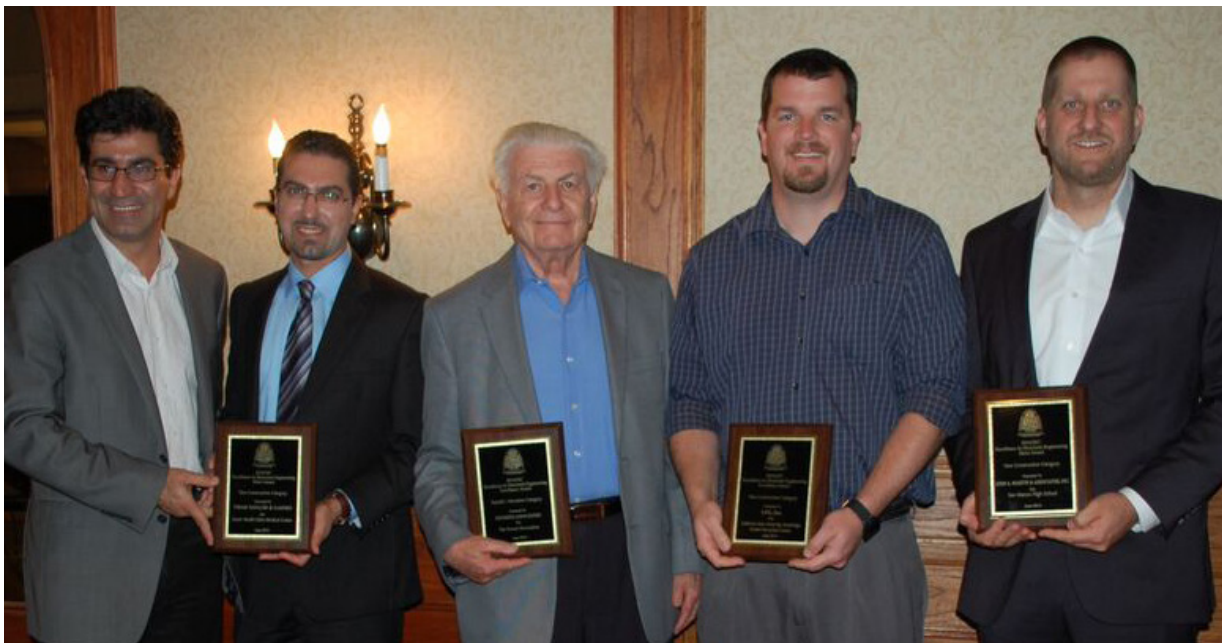
Winners of the 2015 Excellence in Structural Engineering Awards Competition

The Student Recreation Center at California State University Northridge is a nearly 130,000 sq.-ft. facility constructed on a site adjacent to the infamous concrete parking structure that collapsed during the 1994 Northridge earthquake. Opened in January, 2012, the facility provides state-of-the-art technology in the areas of health and fitness, and includes a three-court gymnasium, a multi-activity court, a rock-climbing wall, running track, racquetball courts, weight and fitness areas, and several multi-purpose studios for aerobics, martial arts, and dance.