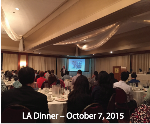
LA Dinner – October 7, 2015