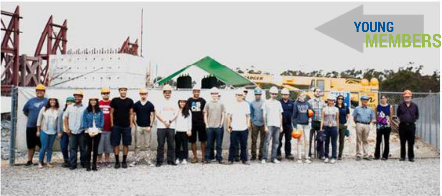
25 SEAOSC Young Members viewed the inner workings of the NEES @ UCSD Shake Table in July.

This past July, SEAOSC YM was given the opportunity to once again take a tour of the NEES @ UCSD Shake Table Facility. This annual event brought in 25 YM members from the LA area down to San Diego. The tour started off with presentations of past and present projects and research conducted at the shake table facility and ended with a tour of the shake table itself. The tour of the table took us underneath the table where we were able to see all of the hydraulic lifts and actuators that make the shake table operate so effectively. The YM Committee would like to thank the staff of NEES @ UCSD for hosting the event and accommodating us.