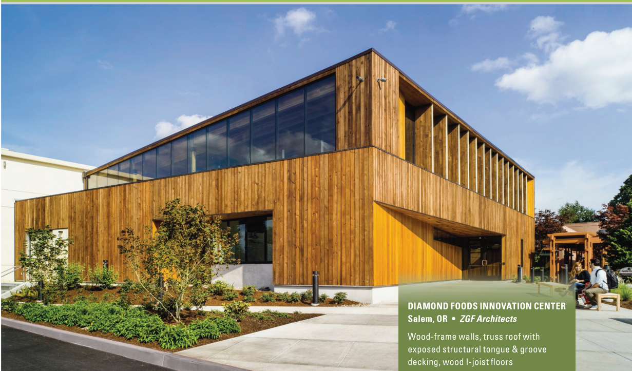
DIAMOND FOODS INNOVATION CENTER Salem, OR • ZGF Architects

Wood-frame walls, truss roof with exposed structural tongue & groove decking, wood I-joist floors