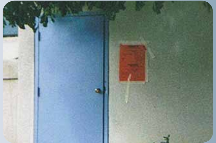
An apartment building on White Oak Avenue in Northridge was “red tagged” on Jan. 19, 1994, two days after the earthquake.

Having seen the affects of the earthquake, it was really neat to then