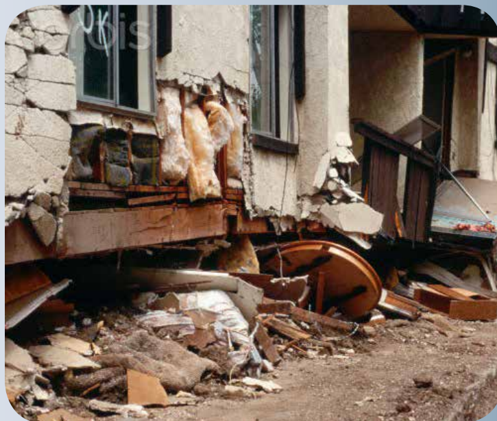
Northridge Meadows apartment complex May 5, 1994. The building collapsed onto the ground floor killing 16 people. Here you can see a kitchen table among the debris.