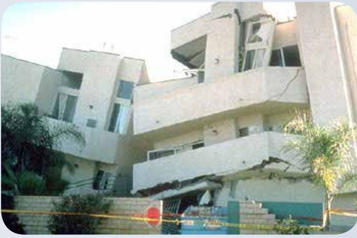
San Fernando Valley Apartment Damage: Rear view of a damaged three-story apartment house with a first-level garage. The two wings of the building collapsed into each other across the formerly intervening courtyard during the partial collapse of the parking level.