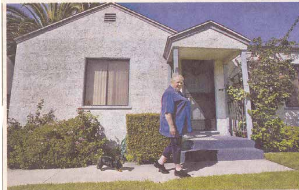
BRYAN CHAN, Los Angeles Times

A state grant program subsidizes retrofits for low- to moderate-income owners.