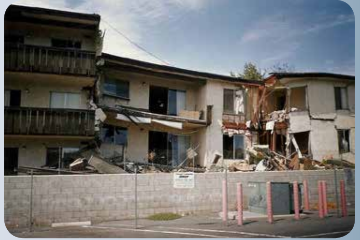
Northridge Meadows apartment building over 6 months after the Northridge earthquake, August, 1994.

While we were searching the front, eastern portion, of the complex, Riverside Urban Search and Rescue arrived and were stationed at the rear portion of the building from which they began clearing the