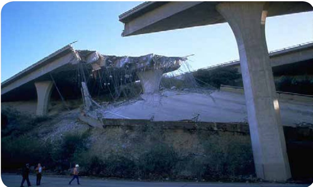
Many roads, including bridges and elevated highways were damaged by the earthquake, affecting commuters for months.