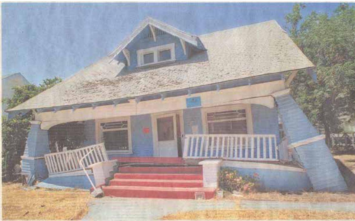
Los Angeles Times

Alan Hanson submitted these scans of Los Angeles Times newspaper headlines. The top article can be read in its entirety at http://articles.latimes.com/2003/oct/19/realstate/re-retrofit19/2